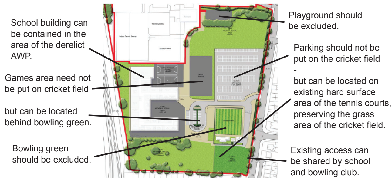
(Plan taken from the LBS Feasibility Report produced by Atkins for LBS April 2015)